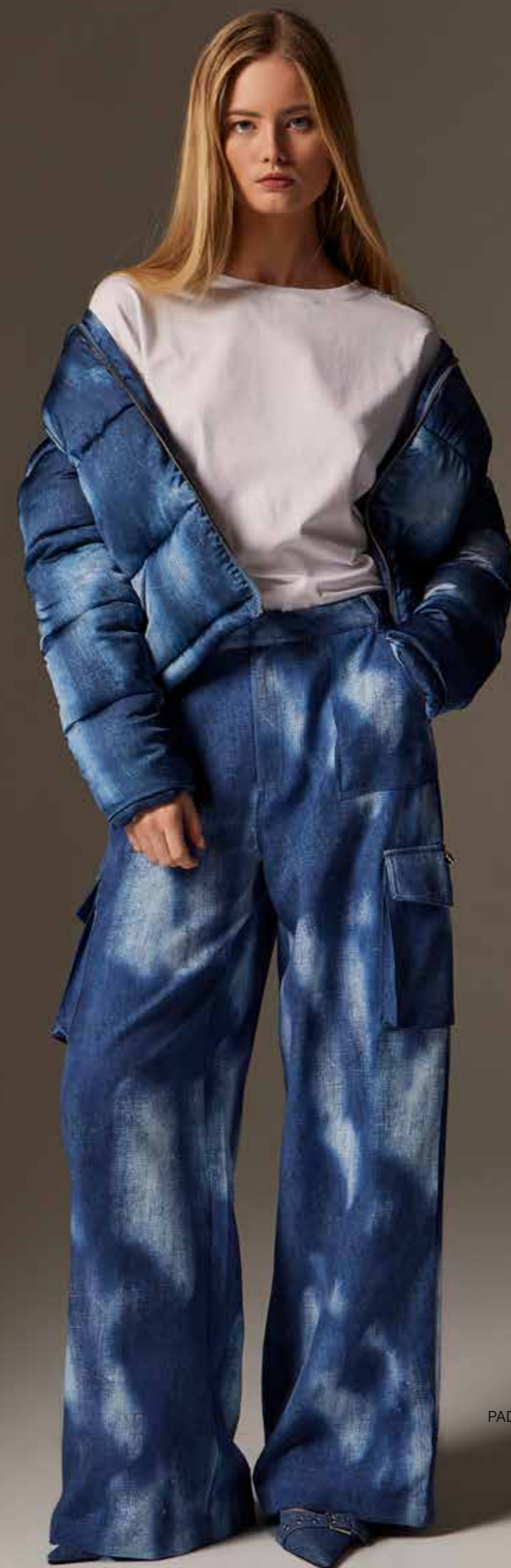
PADDED JACKET 421ND35008 T-SHIRT 421ND64005 TROUSERS 421ND25004