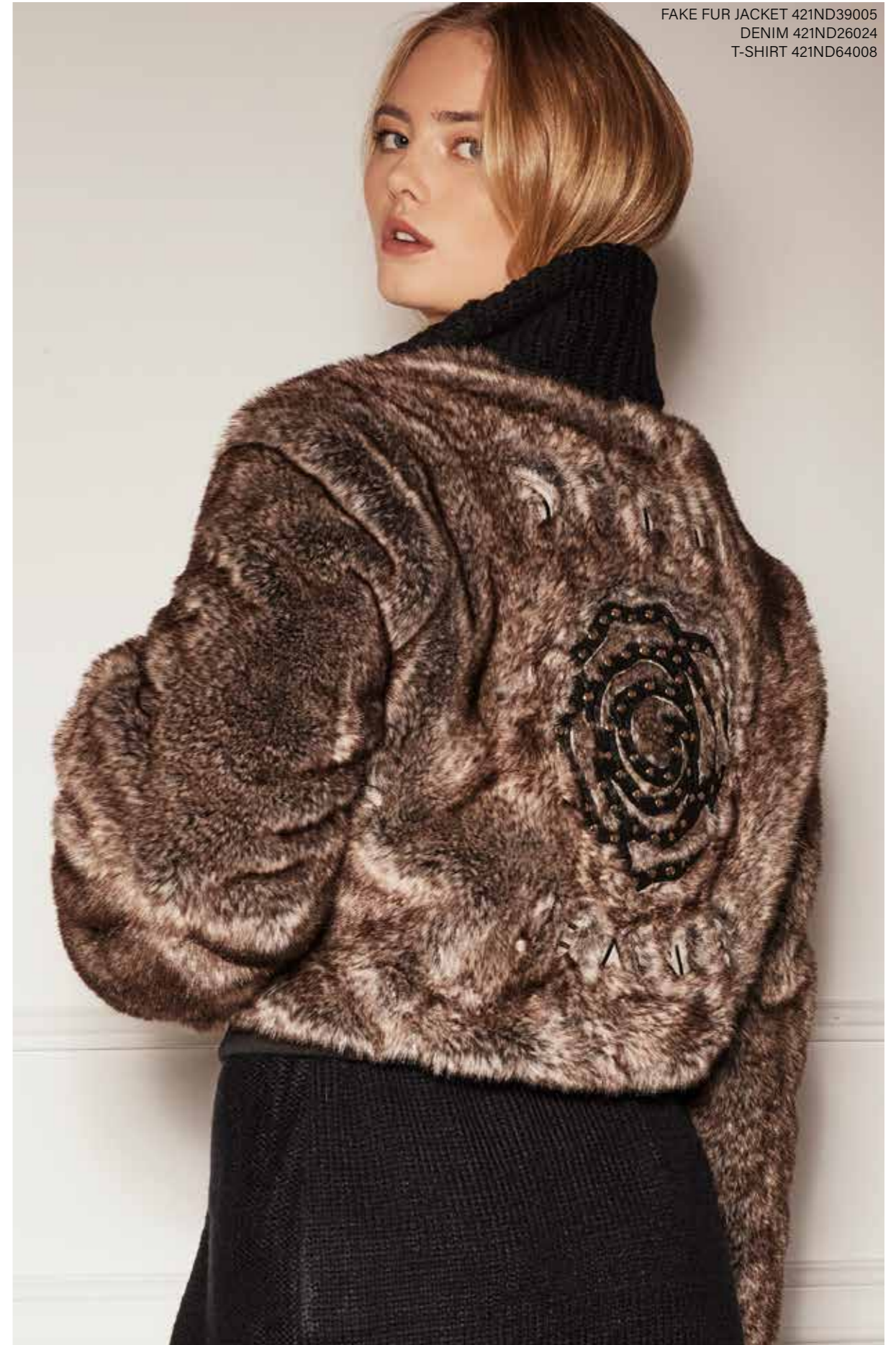
FAKE FUR JACKET 421ND39005 DENIM 421ND26024 T-SHIRT 421ND64008