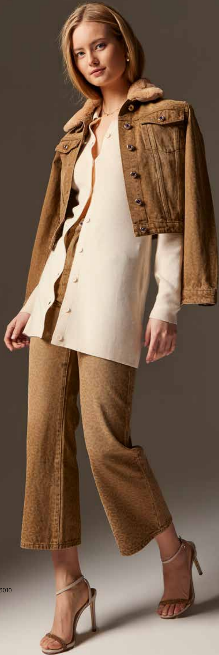
DENIM JACKET 421ND36010 SWEATER 421ND53016 DENIM 421ND26006