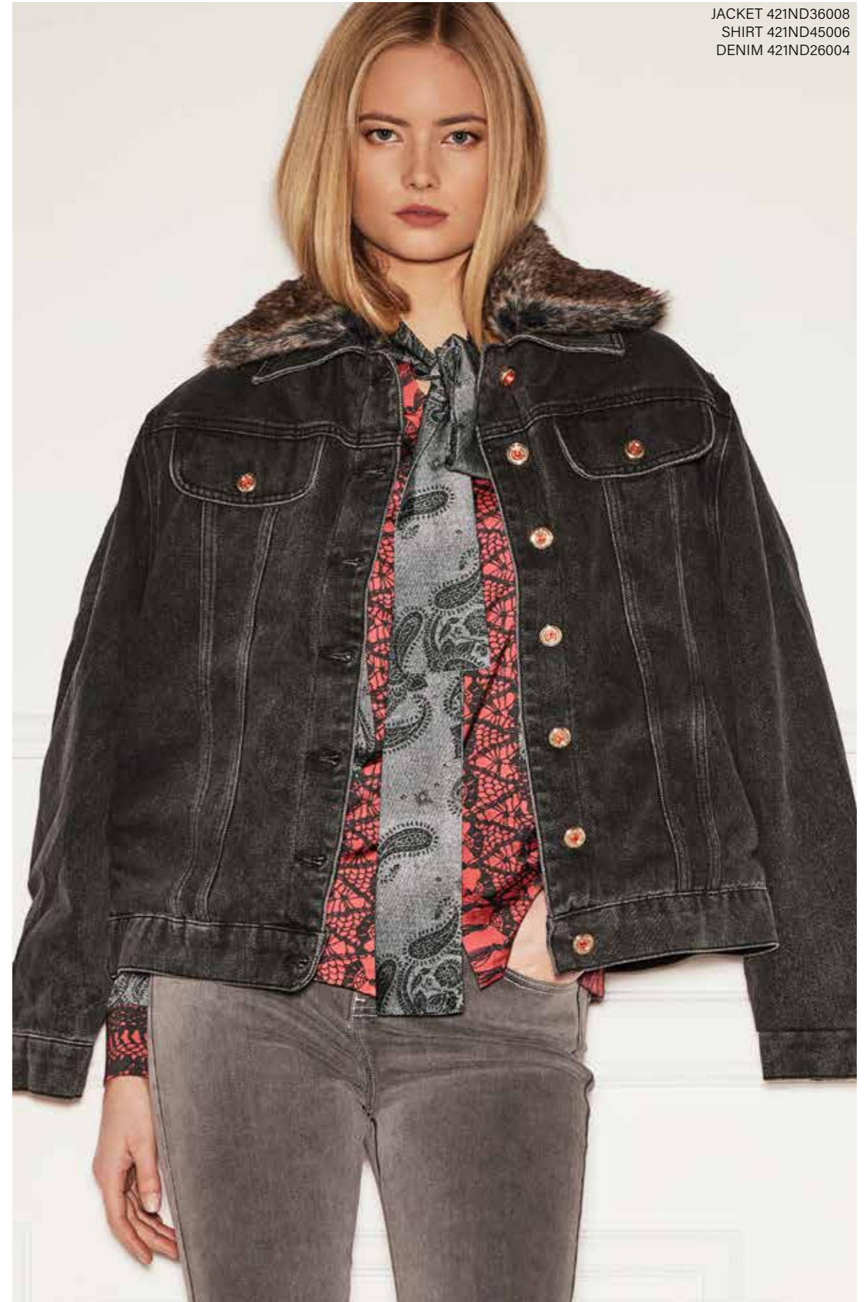
JACKET 421ND36008 SHIRT 421ND45006 DENIM 421ND26004