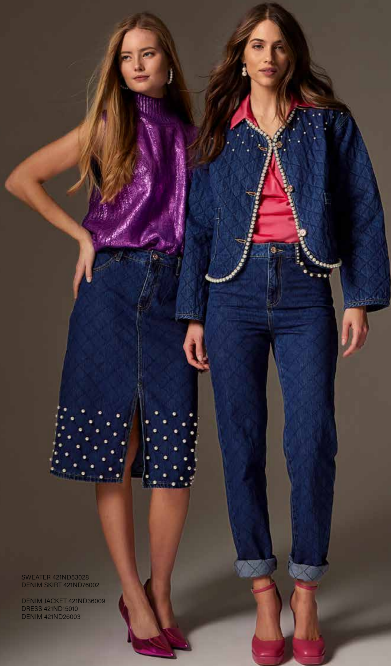
SWEATER 421ND53028 DENIM SKIRT 421ND76002