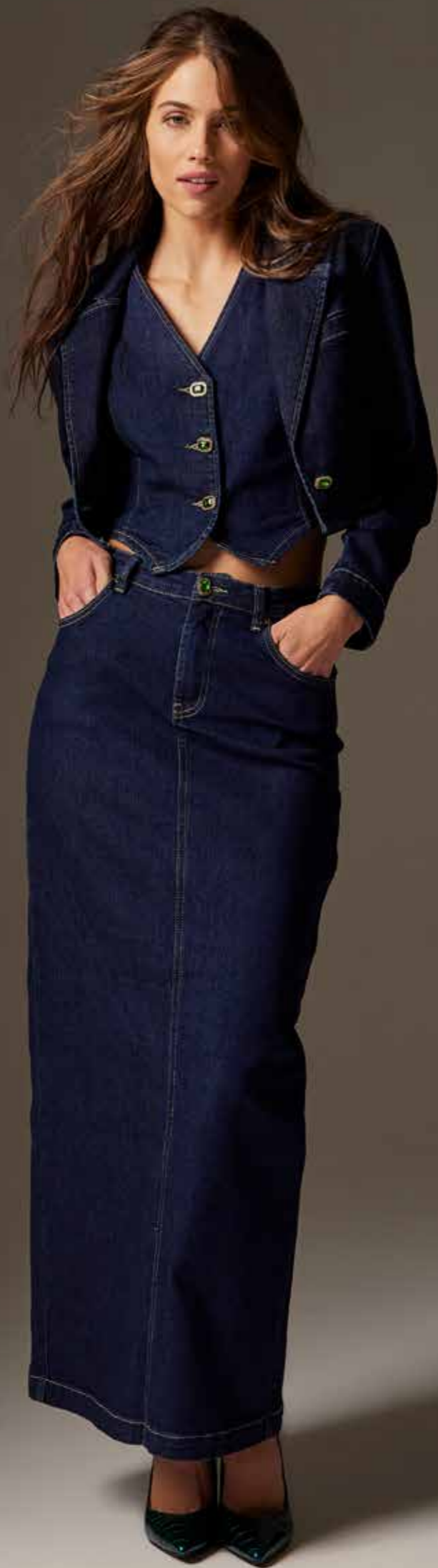
DENIM JACKET 421ND36006 DENIM GILET 421ND36005 DENIM SKIRT 421ND76001