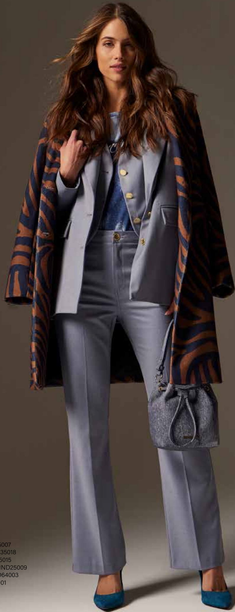
COAT 421ND35007 JACKET 421ND35018 GILET 421ND35015 TROUSERS 421ND25009 T-SHIRT 421ND64003 BAG 421DR90001