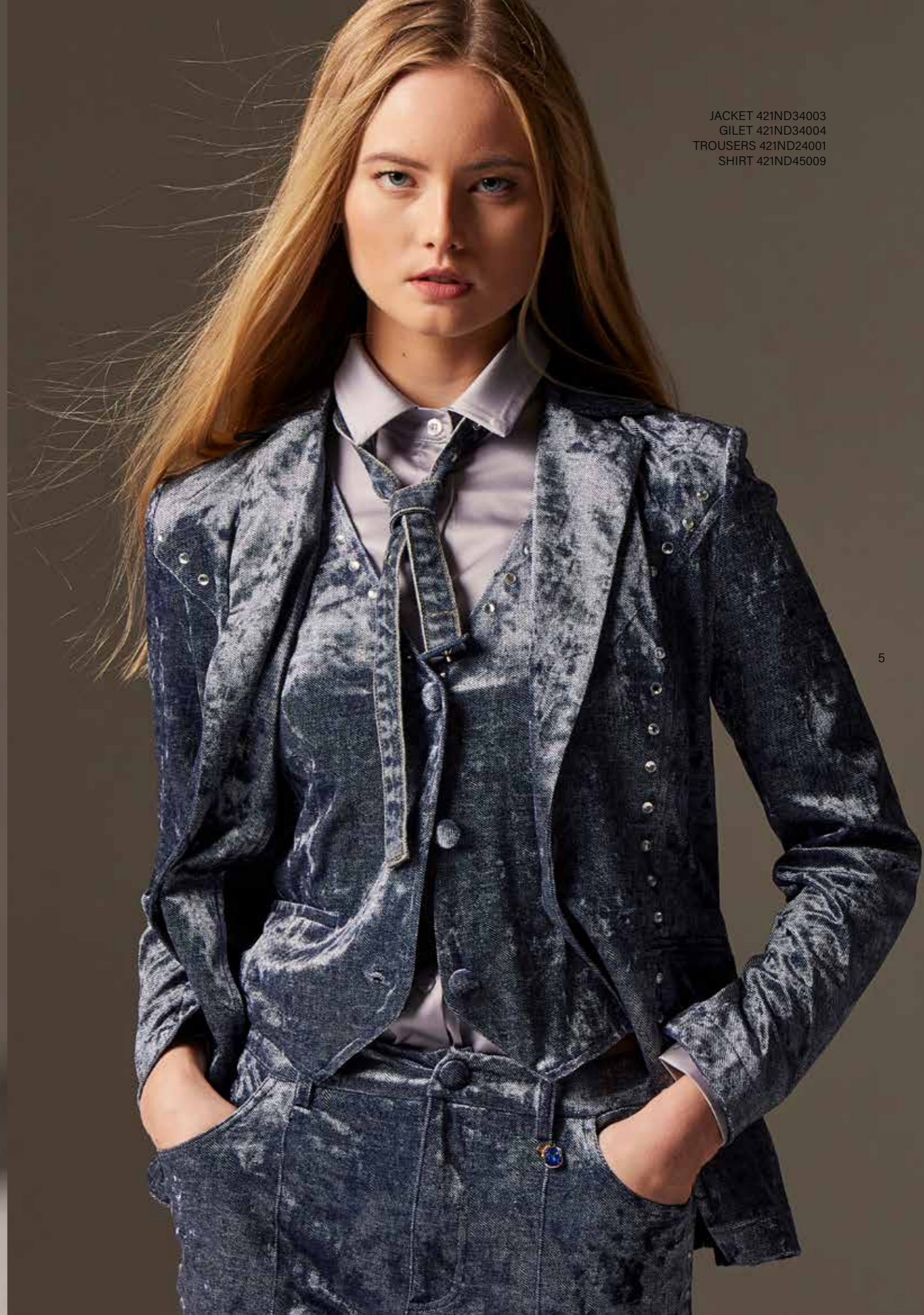
JACKET 421ND34003 GILET 421ND34004 TROUSERS 421ND24001 SHIRT 421ND45009