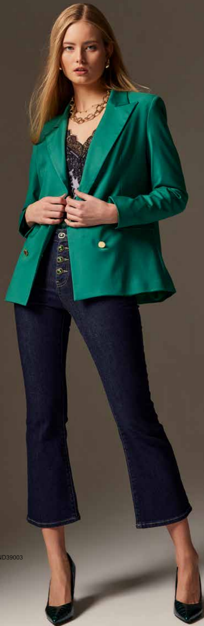
SHEARLING JACKET 421ND39003 JACKET 421ND35019 DENIM 421ND26021 TOP 421ND45004